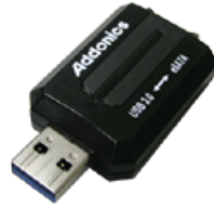
eSATA to USB 3.0 Adapter (Model SESU3CS)